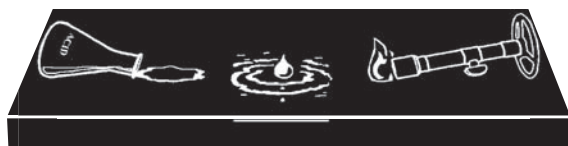
Chemical Resistant • Non-Absorbant • Self-Extinguishing

Epoxy Resin work surfaces are durable, non-porous, man-made stone products that are relatively unaffected by most chemicals, heat, flame and moisture. These super-tough surfaces' physical properties are seldom compromised; however, they do require periodic care and maintenance throughout the life of the lab or school room to keep the surfaces looking like new. Whether you are a facility owner, manager, custodian or lab user, it is helpful to know how to maintain the good appearance of your lab's work surfaces.